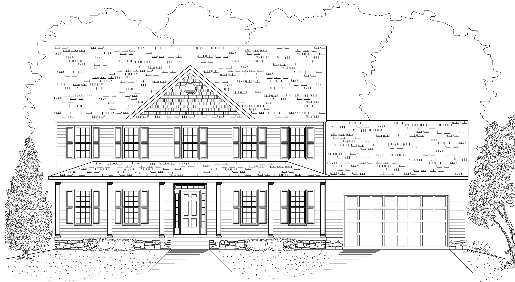
"THE JACQUELYN" ADAMSON HOMES